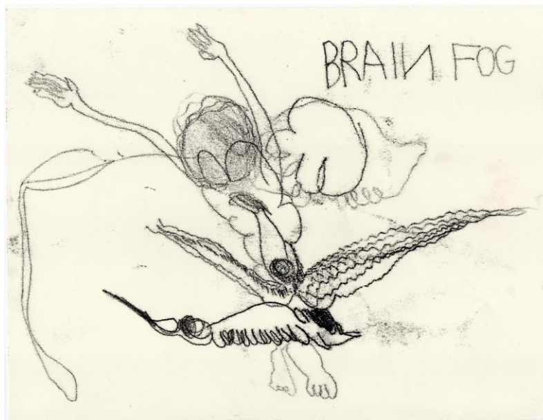
Gosia Watson, Brain Fog , 2022. Monotype on paper.

Fife Contemporary produces high quality public exhibitions, programmes and activities with partners across Fife, as well as supporting artists to develop and extend their practice, and to create and exhibit new visual art and craft projects. Our work with communities facilitates engagement between artists and audiences, enriching the experiences of all.